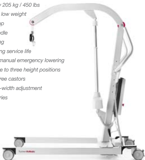
Eva450EE complies with requirements for Class 1-products in the European Medical Device Directive MDD/92/43/EEC.