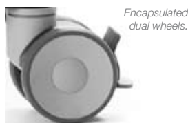
Encapsulated dual wheels.

The ergonomic handle is height-adjustable to enable the caregiver to work more conveniently, comfortably and in an ergonomically correct manner that prevents occupational injuries and minimizes discomfort for those who already have an injury. The smooth surface of the handle is easy to keep clean.